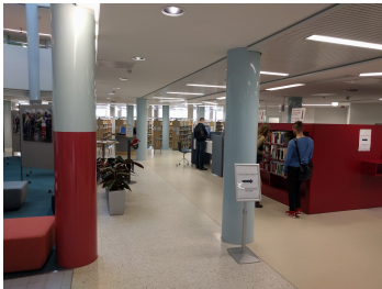
Figure 1: Three of the locations used in our study.

available option-criteria pairs. Each criterion and option can be accompanied by an additional description to further clarify its meaning. Rating of the pairs is implemented using a slider input element (scale from 1 to 100) – identical to the online version. Mobile users can also receive decision support on the questions, but here we focus on the data collection part, i.e. donating knowledge to the available option-criteria pairs. The mobile user interfaces for all the mentioned functionalities are depicted in Figure 2.