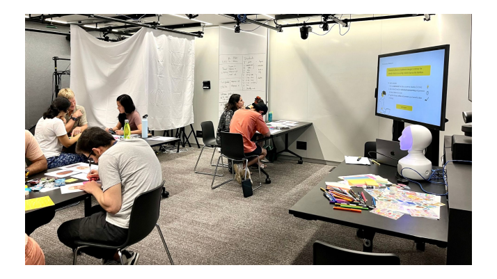
Figure 2: In person design workshop to brainstorm metaphorical representations using a robot's face as the interface.