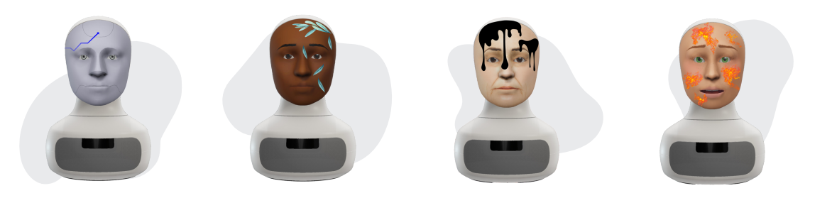
Figure 1: Exemplified designs on how to leverage robot faces as affective visualisation design to convey environmental data by incorporating agency: (left) Robot face as graphical user interface, (middle) metaphorical representation of environmental data via loss of leaves as a symbol of death or dripping oil [19] combined with an aging face, (right) blazing fire combined with negative facial expressions.

Wafa Johal The University of Melbourne Melbourne, Australia wafa.johal@unimelb.edu.au